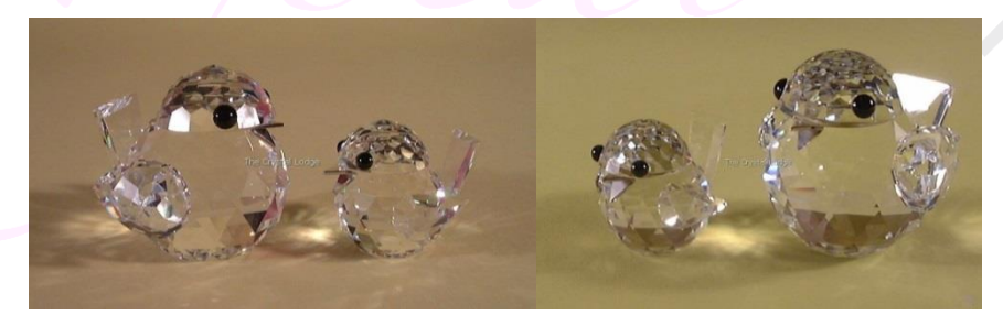
Sparrow large USA shown with sparrow mini

The mini sparrow is ¾" (19mm) tall and was introduced in 1979, retiring in 1991. The USA exclusive large sparrow (7650NR32) stands at 1 ¼" (32mm) tall, identical in design, only difference being the size. Designed by Max Schreck, both sparrows have silver colour metal beaks. The large one was available from 1983 to 1988.