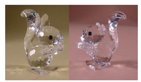
L-R: Squirrel (global) and Squirrel (USA) - note the smaller ears