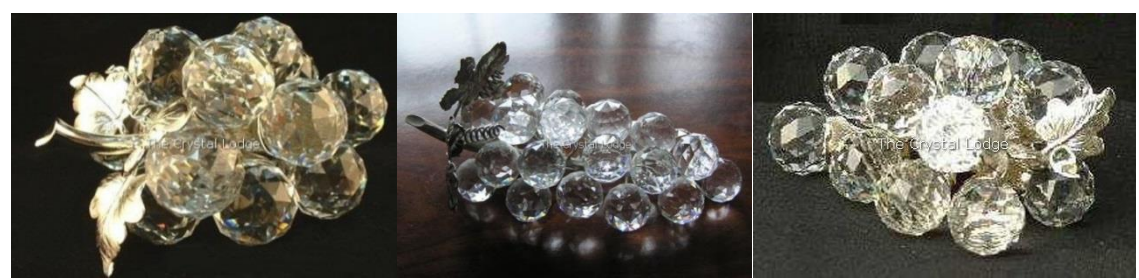
L-R: USA grapes rhodium – large, medium, small