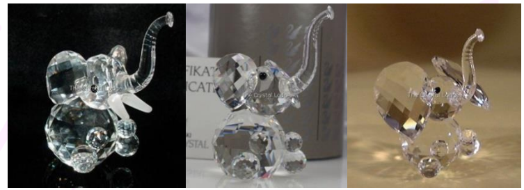
L-R: Dumbo (USA) 1987 v2, 1998 v3, 1998 v4

In 1987 and 1988 a small number of Dumbos were available from Disney Theme Parks in the USA. Differences were noted in the size of the ears and whether tusks were present and if so, the diameter of them. 1987 saw 3 varieties issued: Version 1 has small ears and thin tusks, Version 2 has small ears and thick tusks, Version 3 has small ears and no tusks. Then in 1988, there were 2 more pieces, Version 4 has large ears and no tusks, Version 5 has large ears and thick tusks! The code number was the same for all versions, 7640 NR 35.