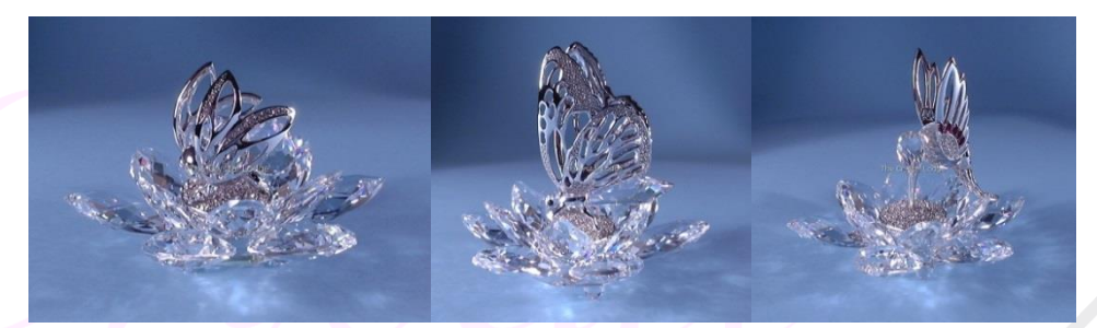
L-R: Rhodium in-flight Bee (7553NR200), Butterfly (7551NR200), Hummingbird (7552NR200)