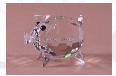
Pig mini USA (disc tail)

Originally, the pig mini which we are used to seeing with a wire tail was issued in the USA market with a flat disc shaped tail (7657 027 000). It was available between 1982 and around 1994 when it was replaced by the version with the wire tail that was already available globally.