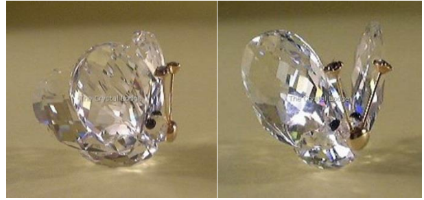
Butterfly mini (USA) shown from different angles

In the USA market, there was a mini butterfly (7671 030 000 or 7671 NR 30), which unlike other butterflies which were issued globally at that time, has no base stone. The lack of base stone means the butterfly is just 1" (25mm tall). The butterfly has a gold round nose and antenna, and was only available from 1985 to 1988.