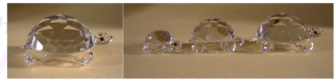
L-R: Photo 1: King Turtle (USA), Photo 2: family grouping showing small turtle, large turtle and king turtle

In addition to the giant, large and small turtles (sometimes referred to as tortoises) in the USA there was another size of turtle available. This king sized turtle (7632 NR 75) was 3" (75 mm) long and was available from 1983 to 1988.