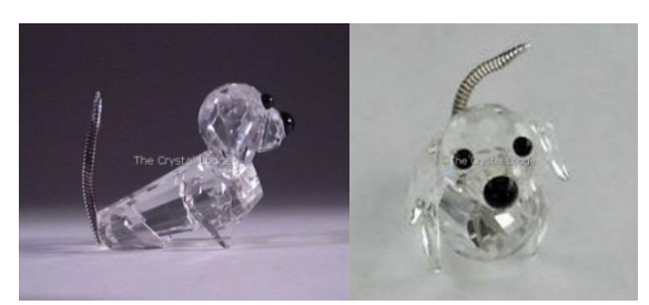
Dachshund mini (USA)

The mini USA dachshund has the code number 7672 042 000 (identical to the frosted tailed mini dachshund) or 7672NR42. This metal tailed dog was available from 1985 through until the end of 1988, so it can be found with either logo, although it is more likely to be found bearing the old SC marking. The dachshund is 1 1/4" (32mm) long.