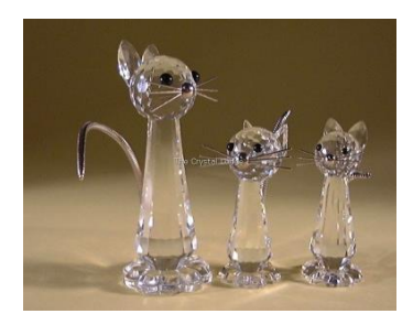
L-R: Cat tall, Cat medium (USA), Cat replica

The USA medium cat (7634 NR 52) is approximately 2" (50mm) tall and has silver whiskers and a metal tail which can be floppy or stiff. This cat is easily distinguishable from the tall and replica cats as it is the only one to have pointed ears. This American feline was available between 1983 and 1987. This means that it can only be found with the old SC logo, as it was retired before the swan logo was introduced. The family group picture shows the tall cat, medium USA cat and the replica cat together demonstrating the differences between each of the designs.