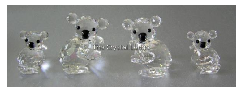
L-R: Koala mini (USA), Koala large, Koala large (USA), Koala mini

The large koala globally (excluding USA) was assembled to face left, but up until 1993 large koalas in the USA (7673NR40) were assembled facing right! Similarly, the mini koala in the USA (7573NR30) faced left, but the global edition faced right! The 2 different USA koalas continued in production until 1993, when they were replaced by the global koalas and remained in this format until the pieces retired.