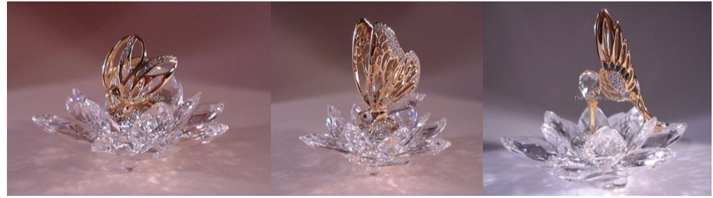
L-R: Gold in-flight Bee (7553NR100), Butterfly (7551NR100), Hummingbird (7552NR100)

The in-flight series were a set of 6 pieces which were produced in gold and rhodium finish. They comprised a bee, a butterfly and a hummingbird all sitting on a flower shaped base. These were only ever available in the USA market. Each piece has a diameter of 4" (102 mm) and the entire range was issued in 1985. The rhodium pieces retired in 1986 and the gold in 1988.