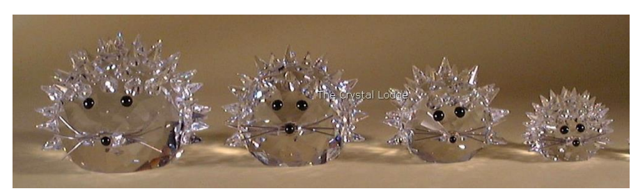
L-R: Hedgehogs king (USA), large (global), medium (global), small/tiny (USA)

The king and tiny hedgehogs were only ever available for sale in USA and Canada leading to a situation where confusingly, the medium (40mm) was often referred to as "small" in Europe, while the "tiny" (30mm) one was called "small" in USA! The hedgehogs are easily identified by the diameter of their body stones. The King Hedgehog (7630 NR 60) is 60mm across, the Large 50mm, Medium is 40mm, and finally the tiny hedgehog (USA) has a 30mm diameter body stone (7630 NR 30). The body stone size is reflected in the last number of the code numbers.