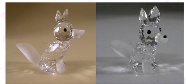
L-R: USA fox large (no black dot on nose), Fox large (global)

In 1987, the large fox was introduced into the Woodlands Friend category, and for the first year in the USA, no black dot was placed on the nose of the fox. The design always featured a black dotted nose elsewhere. Code numbers for both pieces is 7629 070 000.