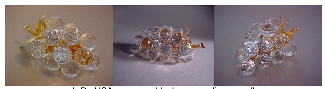
L-R: USA grapes gold – large, medium, small

In the USA there were completely different sets of grapes from those which were issued in Europe. All the USA grapes were retired and replaced by the European style grapes, but originally there were 6 types to collect! There were 3 sizes, called not unsurprisingly large, medium and small, all of which could be found in either gold or rhodium finish. The rhodium finish was available for the shortest period (1983 to 1985). The first retiree from the gold series were the large grapes which ceased production in 1988, then the small and medium grapes were discontinued to be replaced by the European gold grapes in 1995. The small bunches of USA grapes contained just 15 grapes which were 3/4" (20mm) in diameter (7550 020 015), the medium bunches contained 29 grapes also 3/4" (20mm) in diameter (7550 020 029). The large bunch only had 15 grapes, but these were much larger being 1 1/8" (30mm) in diameter (7550 030 015). Again, clues to grape size and number are in the code numbers, which are the same whether the grapes are gold or rhodium!