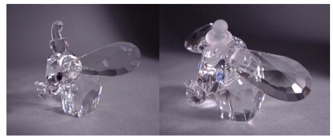
L-R: Dumbo 1990 (black eyes), 1993 (blue eyes)

In 1993, a blue-eyed Dumbo was produced, this one continued in production until 1996 and was available in Disney Theme Parks, but this time included EuroDisney. This blue-eyed Dumbo has a frosted hat, and code number 7640 100 001.